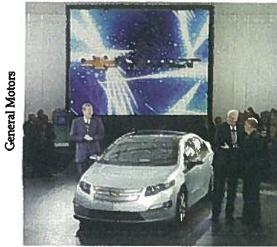
Chevrolet Volt 2008 Introduction

E lectric-powered vehicles are receiving a great deal of attention lately because of the high cost of gasoline. These vehicles should be available to consumers for purchase within the next few years. Surprisingly, Congress seems to be on top of things and, in the recently passed Energy Improvement and Extension Act of 2008 (Energy Act), has authorized a tax credit as an incentive to purchase a plug-in vehicle.